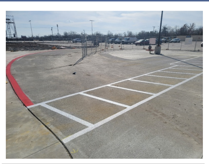
Area D&T Courtyard: Striping in progress.