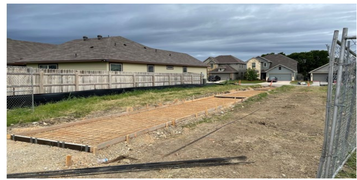
Site: Neighborhood access sidewalk being formed for concrete.