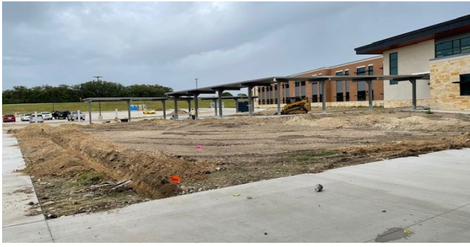
Site: Irrigation installation in progress at west side of building.