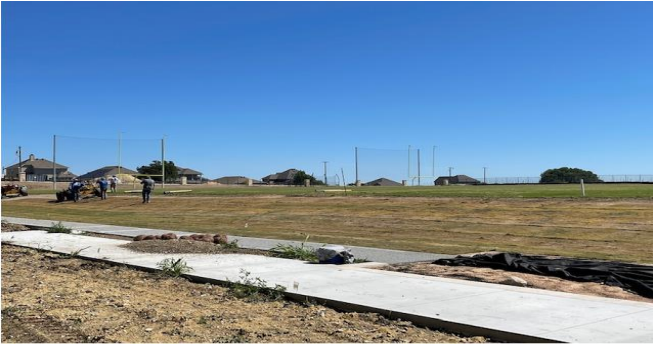
Site: Sod installation in progress behind the football visitor bleachers.