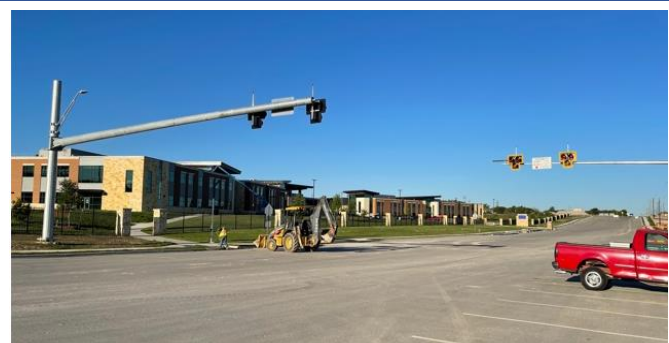
Site: Chaparral crosswalk beacon system near completion.