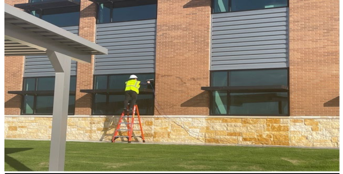
Building: Window washing in progress.