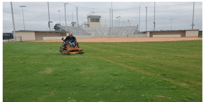
Site: Athletic field being mowed and prepped for competition.