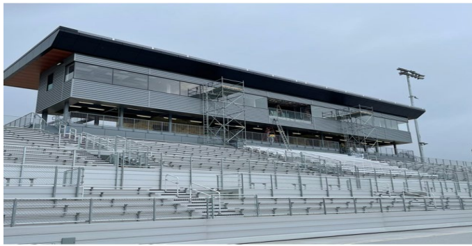
Site: Pressbox sound speaker installation in progress.