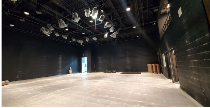
Building: Black box room flooring installed and lighting being terminated and tested.