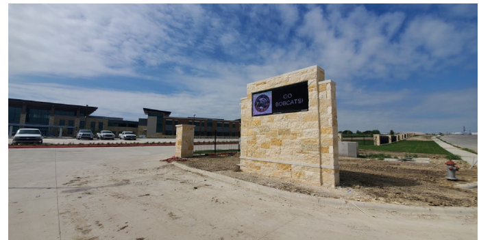
Site: Digital video board installed and terminated at site marquee sign.