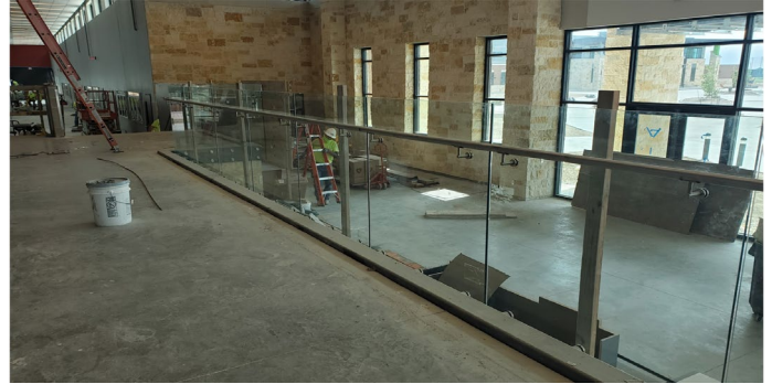
Building: Auditorium lobby glass railing system nearing completion.