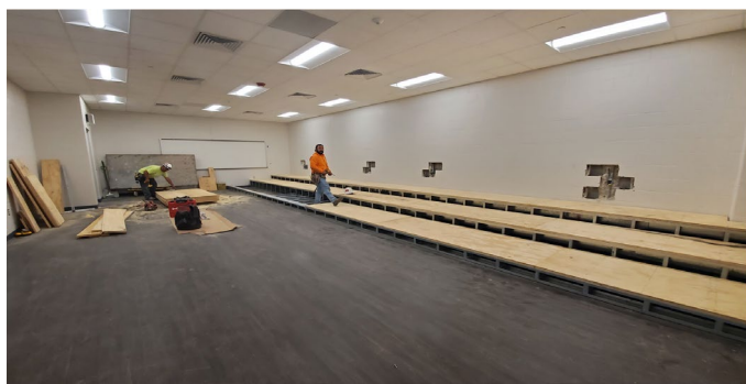
Building: CPR 81 tier seating change being installed at athletics.