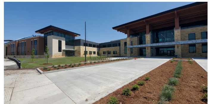
Site: SOD being installed and landscaping being completed at main entry.