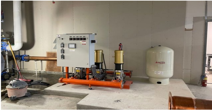
Building: Booster pump installation in progress.