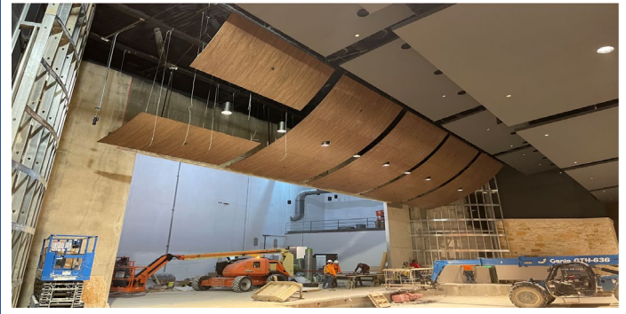
Building: Ovation cloud installation continues in auditorium.