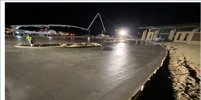
Site: South parking lot concrete being placed and finished.