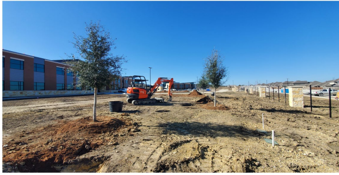
Site: Landscaping in progress.