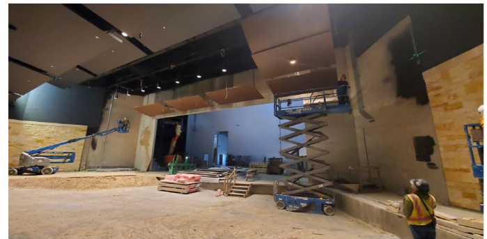
Building: Ovation cloud installation in progress at front of stage.