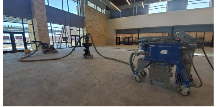
Building: Concrete polishing in progress at Commons Area.