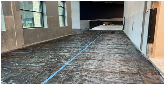
Building: Polished concrete slab area being prepped for place and finish.