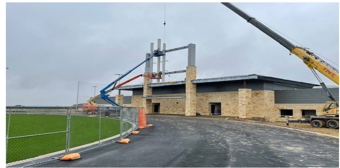
Site: Scoreboard framing and catwalk being installed.