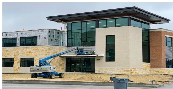
Building: Soffit panel installation in progress at high roof areas.