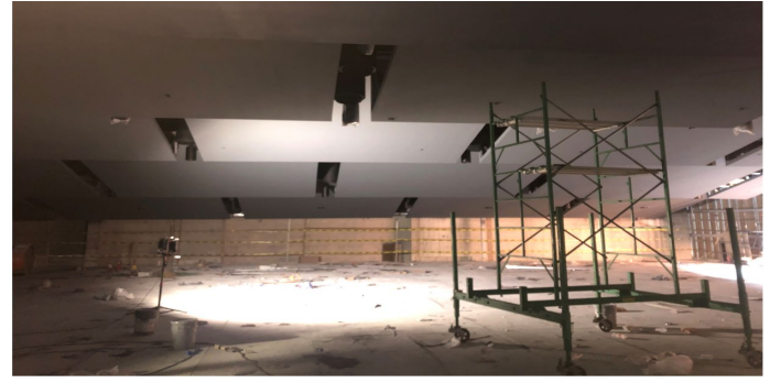
Building: Auditorium ceiling clouds being painted.