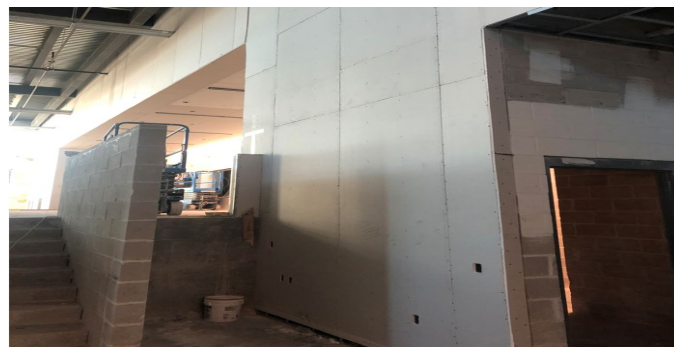
Building: Drywall being installed at Auditorium Lobby.