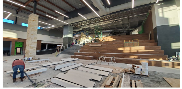
Building: Area G Commons terrazzo stairs being installed.