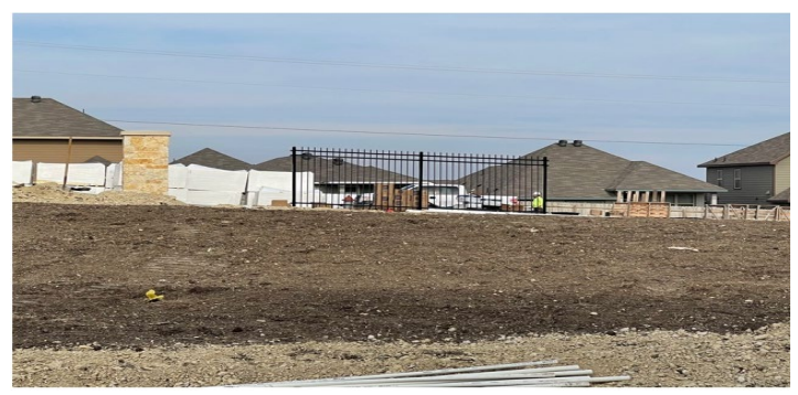
Site: Fence mockup in progress along Chaparral Road.