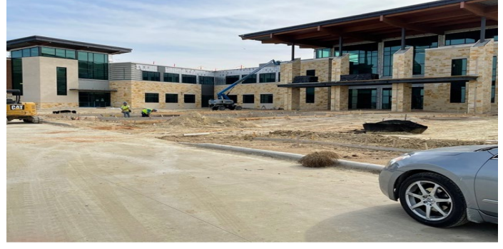
Site: Main entrance concrete paving prep in progress.