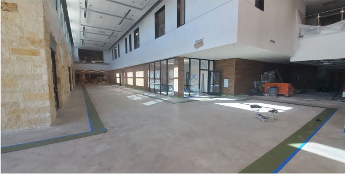
Building: Area D polished concrete in progress.