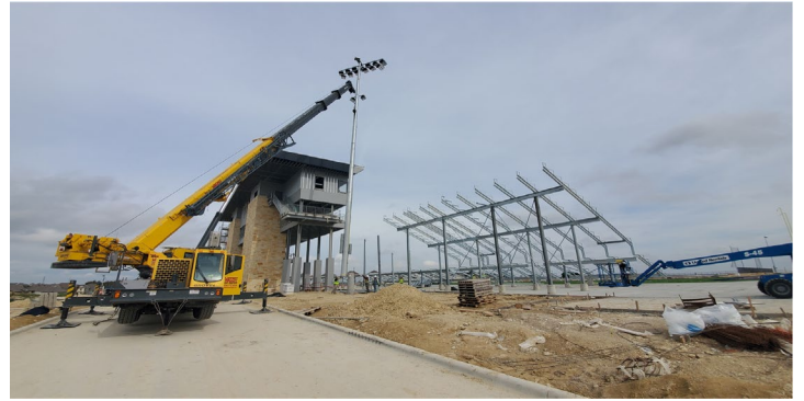
Site: Competition Football Stadium lighting being installed.