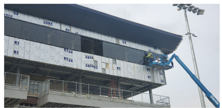
Site: Football Pressbox glazing being installed.