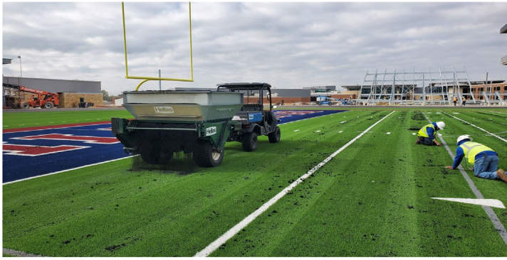
Site: Rubber pellet infill being placed in football field turf.