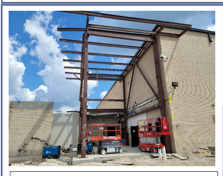
Area D: Structural steel installation in progress.