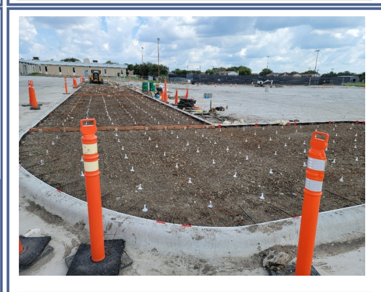
Site: Sidewalk and flatwork installation in progress.