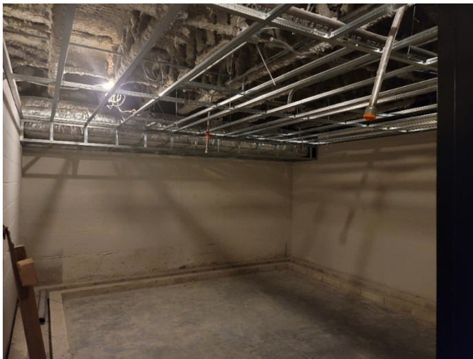
Area D: Ceiling framing in progress.