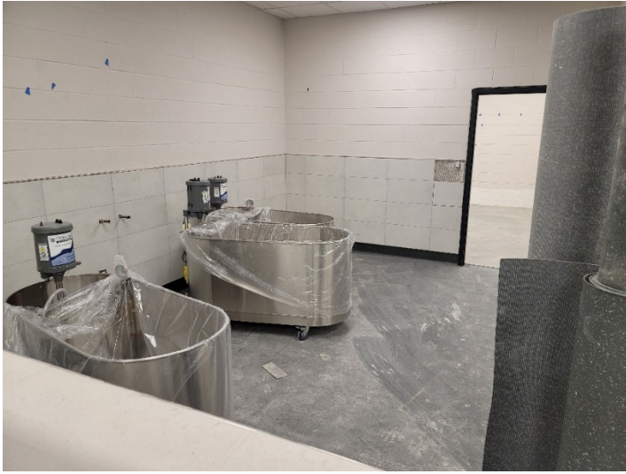
Area L: Whirlpool installation in progress.