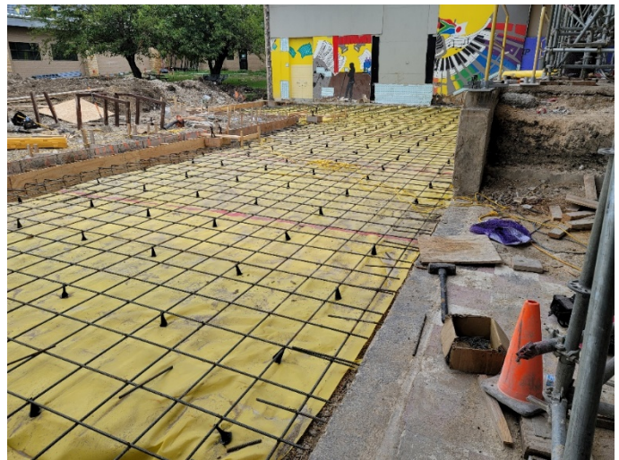
Area T: SOG reinforcement installation in progress.