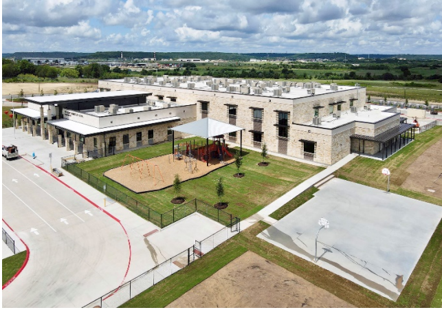
Exterior: Hydromulch and watering to establish grass.