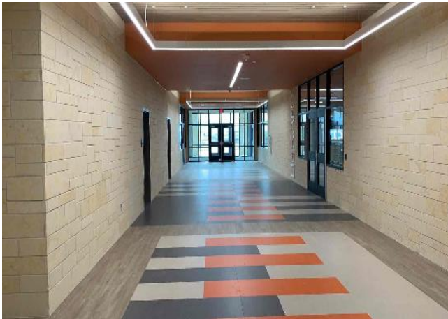
Interior: Main front hallway.