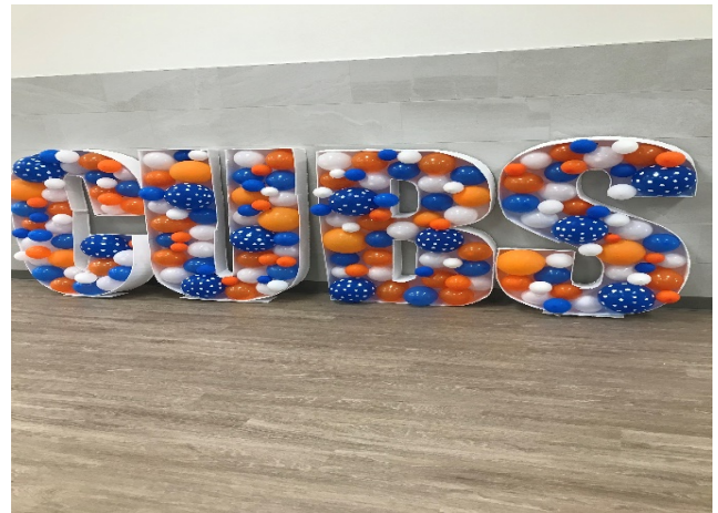
Interior: Campus dedication and meet the teacher.