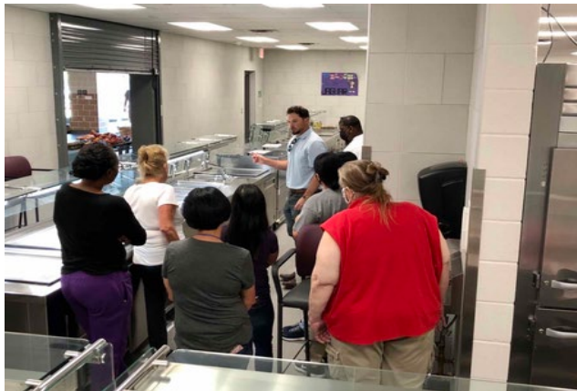
Interior: All campus training is complete.