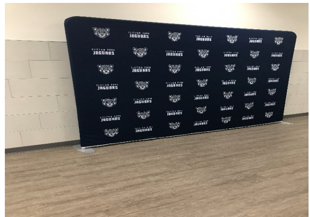
Interior: Backdrop from Dedication.