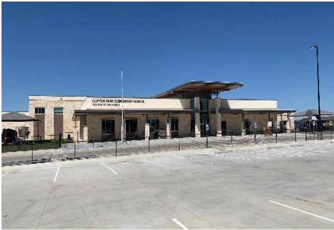
Certificate of Occupancy received.