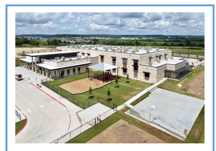
Exterior: Sod and landscaping installed. Hydromulch down and watered.