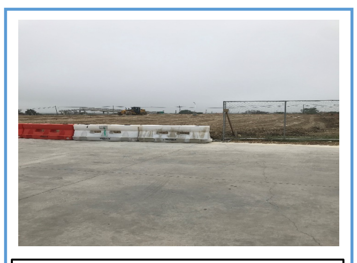
Exterior: Electric run for light poles and sleeves for irrigation.