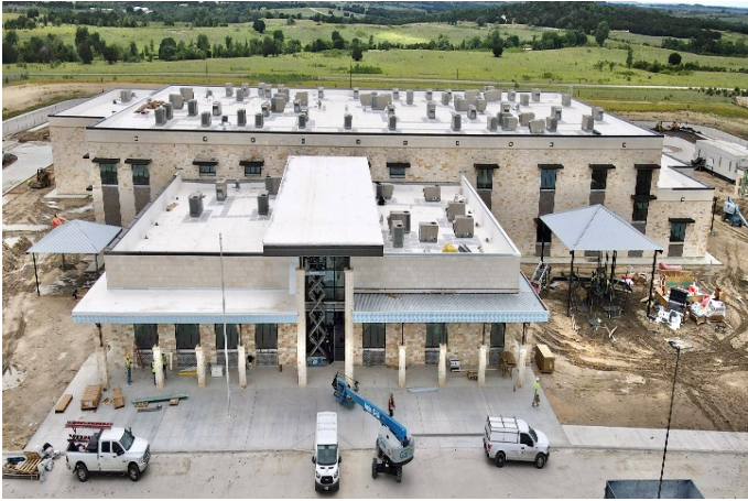
Exterior: Beginning work on the tresa at the canopy entries.