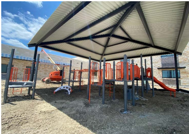
Exterior: Install of the playground has begun.