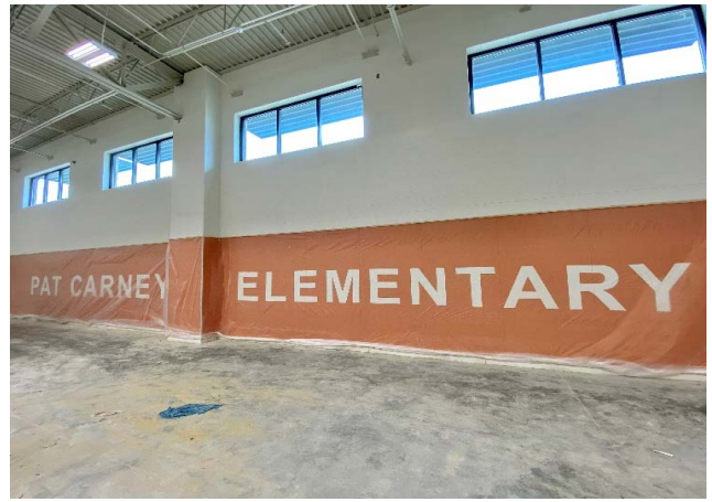
Interior: Laminate wall installed in the PE Activity Room.