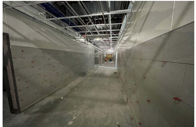
Interior: Hallway wall tile has begun install.