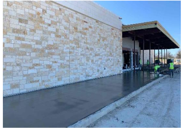
Exterior: Rear paving around the building poured.