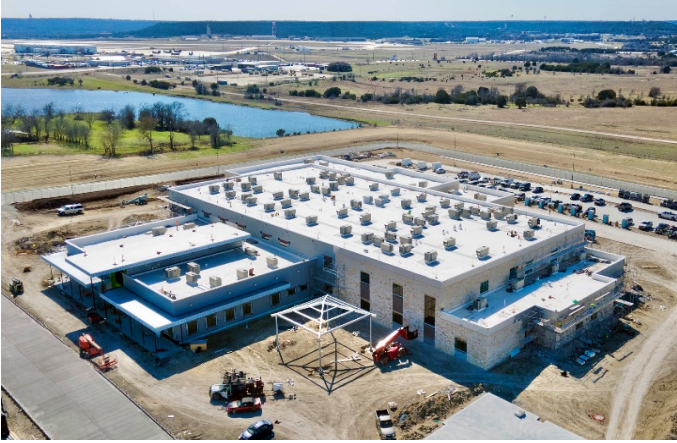
Exterior: Playground canopies and exterior stone veneer.