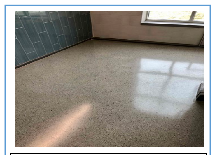
Interior: Terrazzo landings are poured and polished.