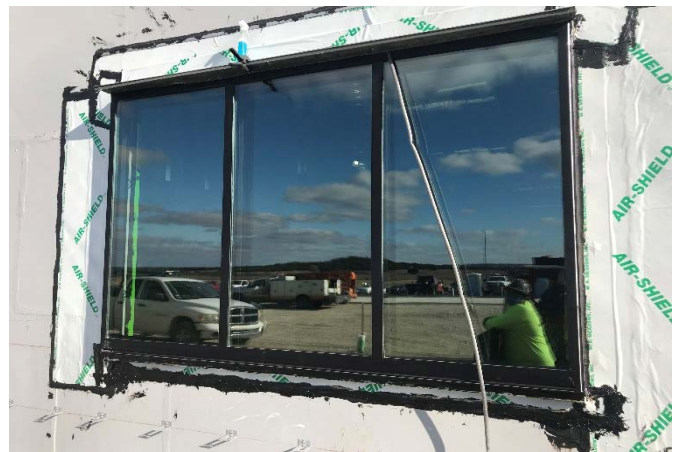
Exterior: Working through flashing and install of acoustic windows to begin.