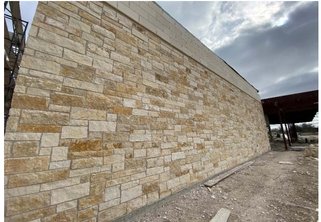
Exterior: Area 4 stone veneer has begun along west side.