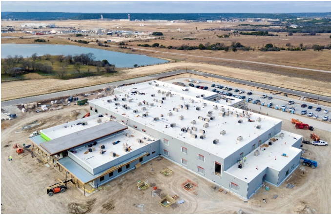
Exterior: Roof top HVAC units all completed.