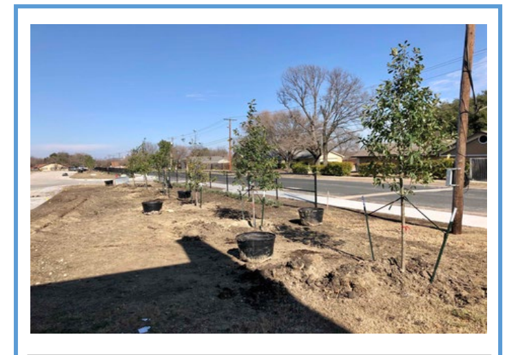
Exterior: Landscaping and trees have begun.