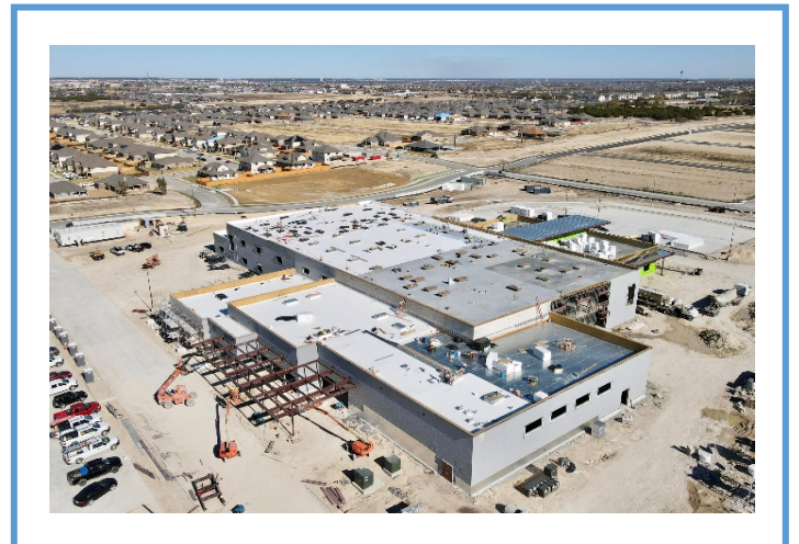
Exterior: Area 4 lightweight concrete to pour, rear canopy steel in progress.