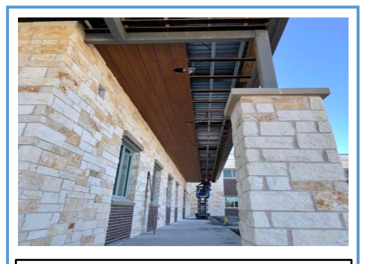
Exterior: Trespa ceiling install in front canopy.