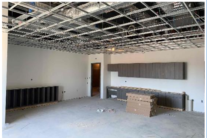
Interior: Casework install has begun in Areas 2 & 3.