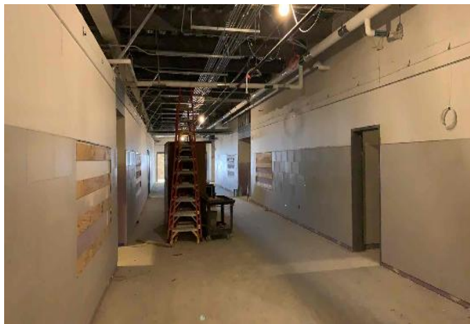
Interior: Wall tile continues through hallways Areas 2 & 3.