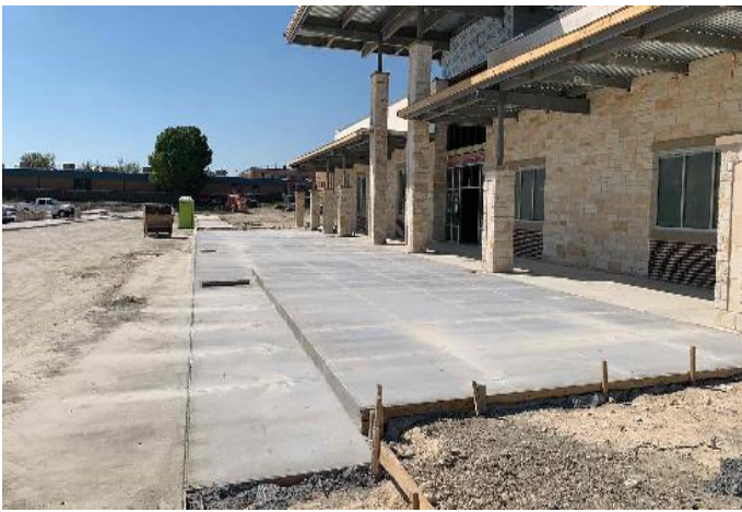
Exterior: Paving at front canopy completed.

Monthly Progress Report - September 2020