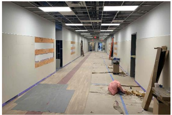
Interior: LVT in classrooms and hallways continues.