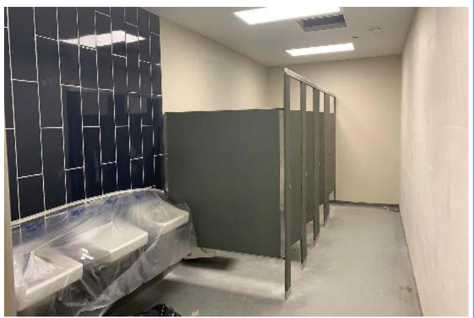
Interior: Restroom flooring installed; partitions and fixtures all being installed.