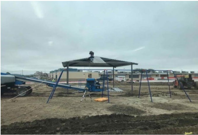
Exterior: Playground canopy roofs going on, playground structures are on site.