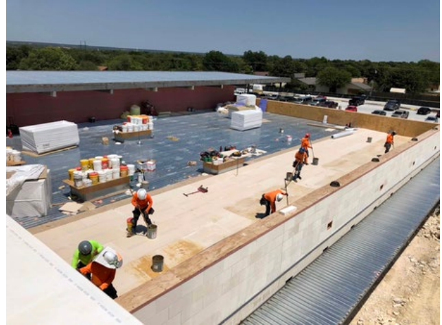
Building: Area 1 roof install.