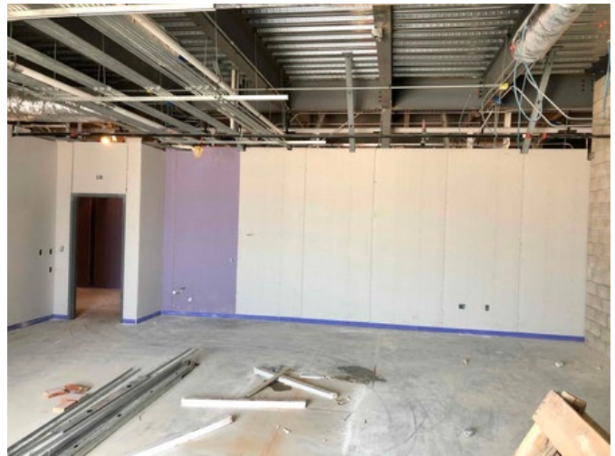
Section 2 & 3: Interior sheetrock installed.