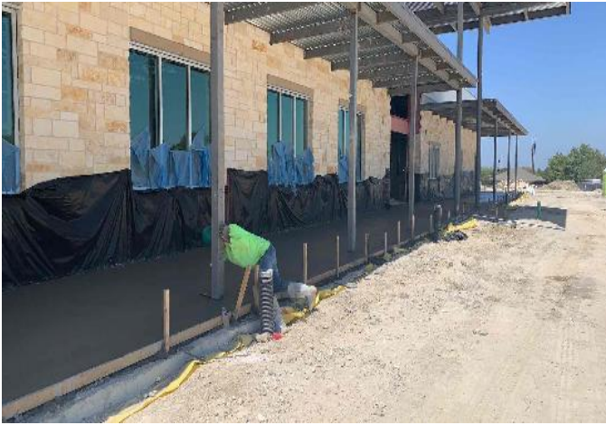
Site: Sidewalks around school & canopy.