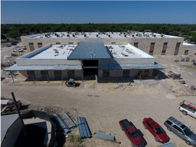
Section 1: Roofing work on Sec 1 and front canopy.