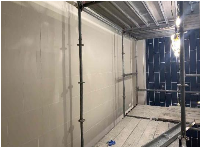
Section 3: Wall tile in stairwells and hallways has begun