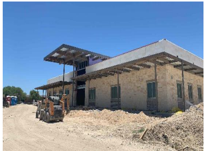
Section 1: Stonework almost complete, finishing Sec. 4.