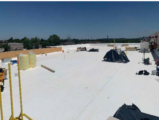
Section 4: Roof membrane install over café & PE.