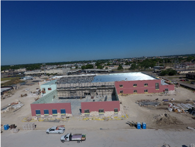
Building: Roof decking Sec 5 & 6 install