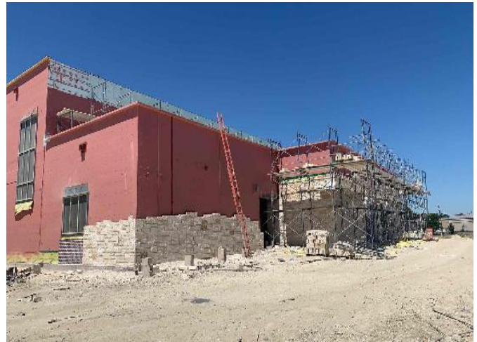
Sections 3: Began window install, stone work continues.