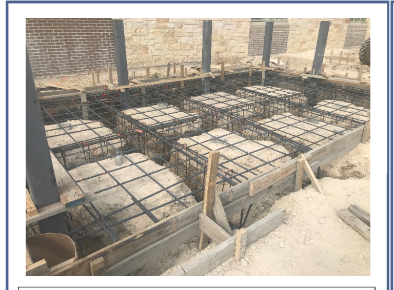
Section 4: Preparing to pour dumpster pad.