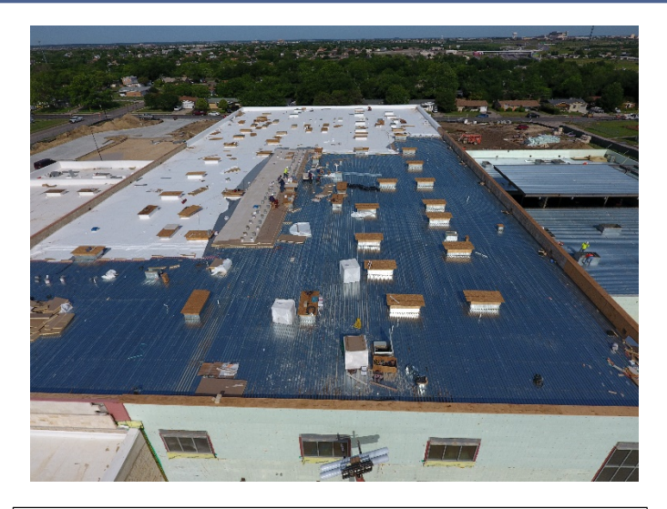
Section 5 & 6 Roof: Roofing in progress with rooftop units to follow