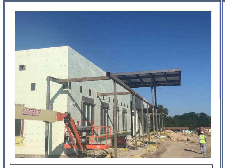
Section 1: Steel for front canopy being installed.