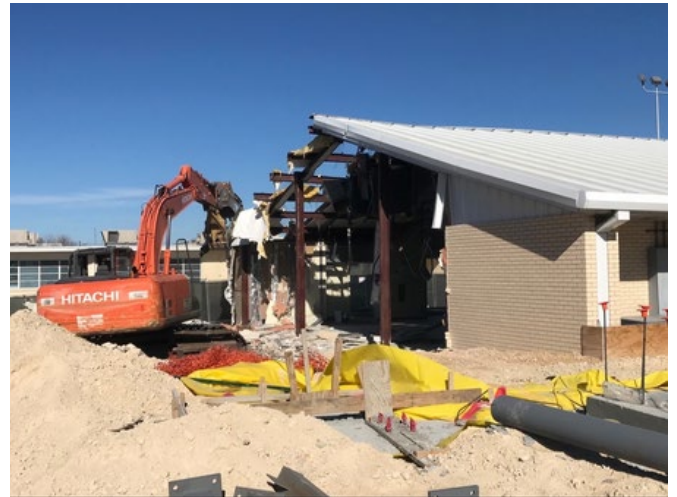
Site: Demolition of existing PE building