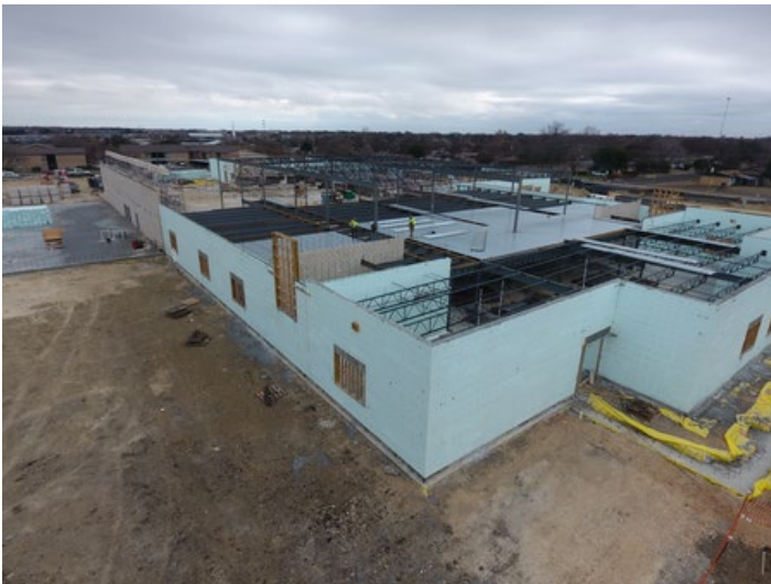
Site: Area 2 & 3 ICF, CMU & Steel