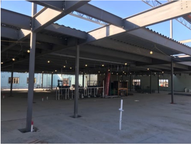
Building: Decking and temp lights installed area 3