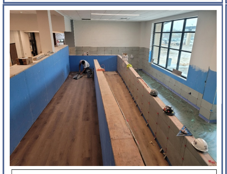
Area T: LVT and ceramic tile installation in progress.