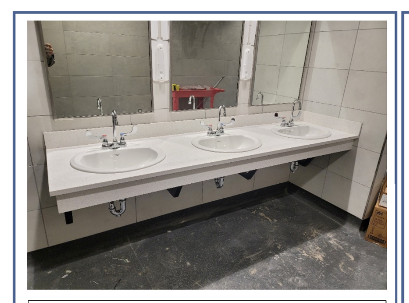
Area D : Solid surface countertop installation complete.