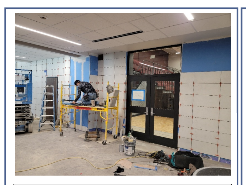
Area D: Corridor tile installation in progress.