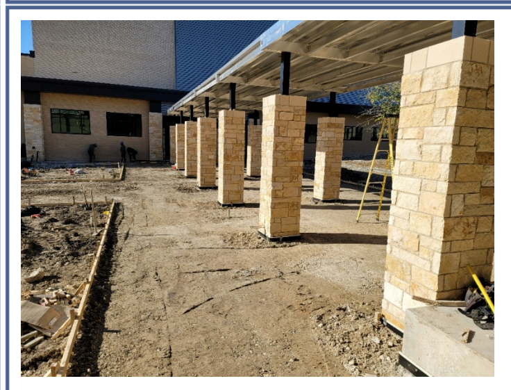
Area D&T Courtyard: Aluminum canopy installation and concrete flatwork prep in progress.