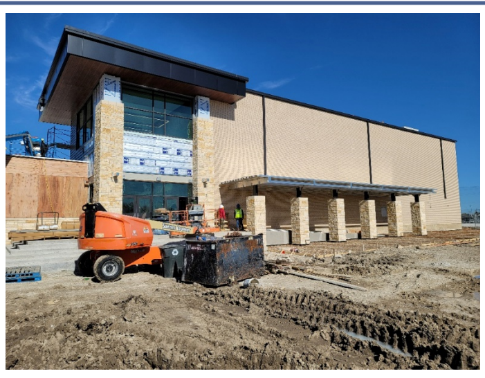
Area D: Aluminum canopy installation and concrete flatwork prep in progress.