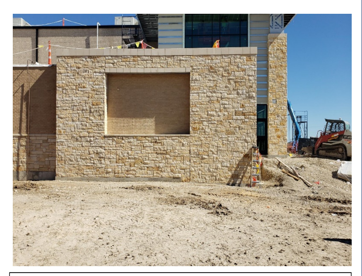
Area D & T: Stone exterior veneer complete.