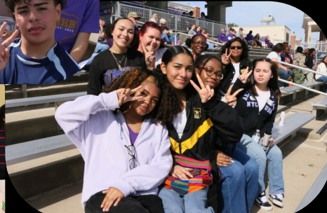
We Got Spirit!